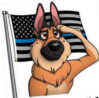
K9 DEMO AND DISPLAY